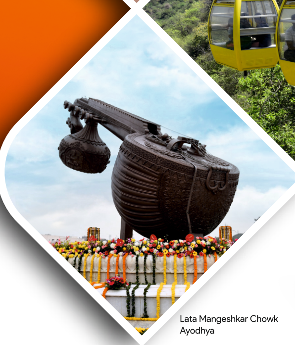
Lata Mangeshkar Chowk Ayodhya