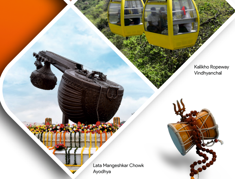
Kalikhro Ropeway Vindhyanchal